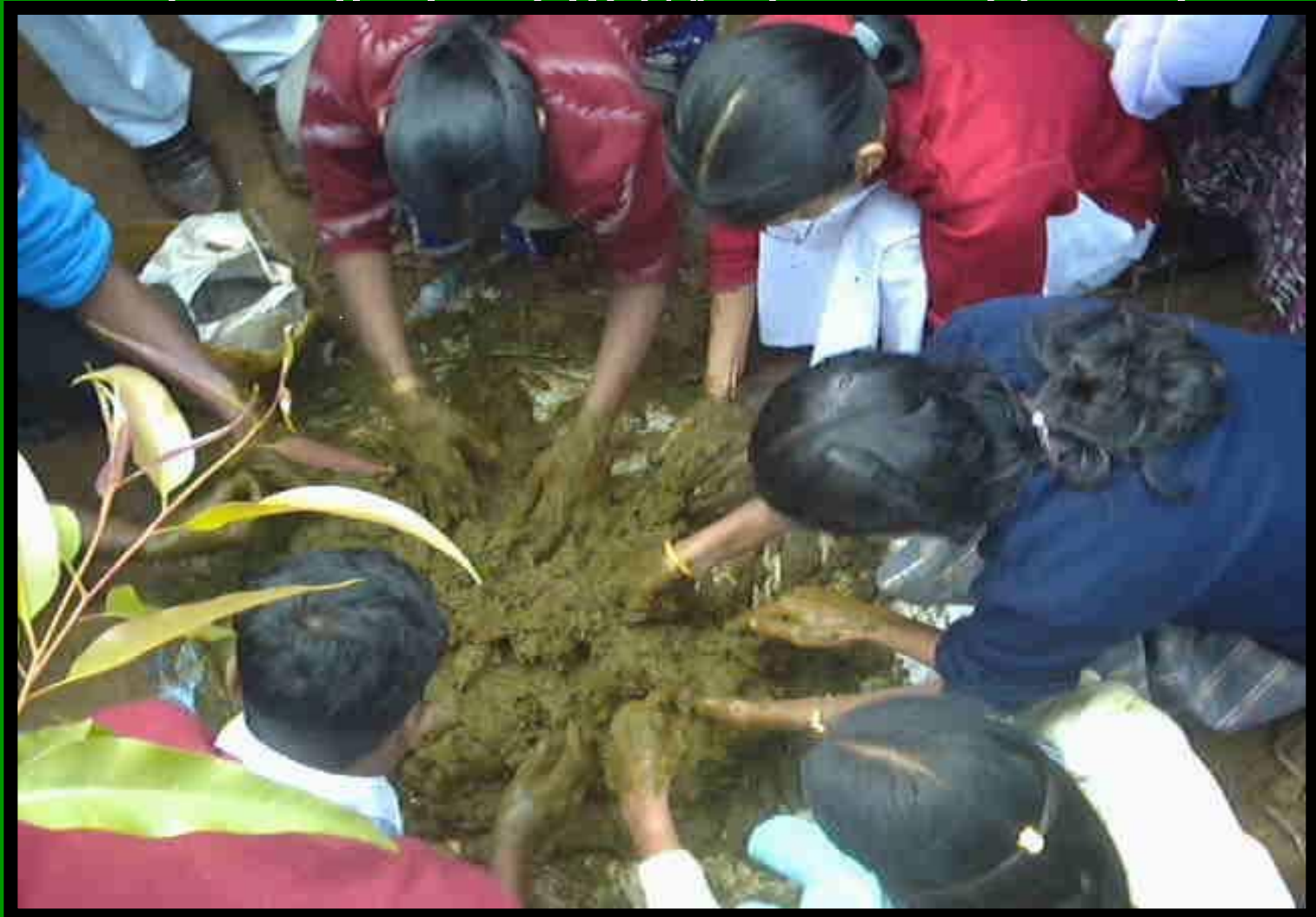
The Friends of HOPE

Making Panchacavium – cow pat, cow urine, ghee, curd and milk – used as fertilizer, pesticide good for severe skin conditions and can be taken